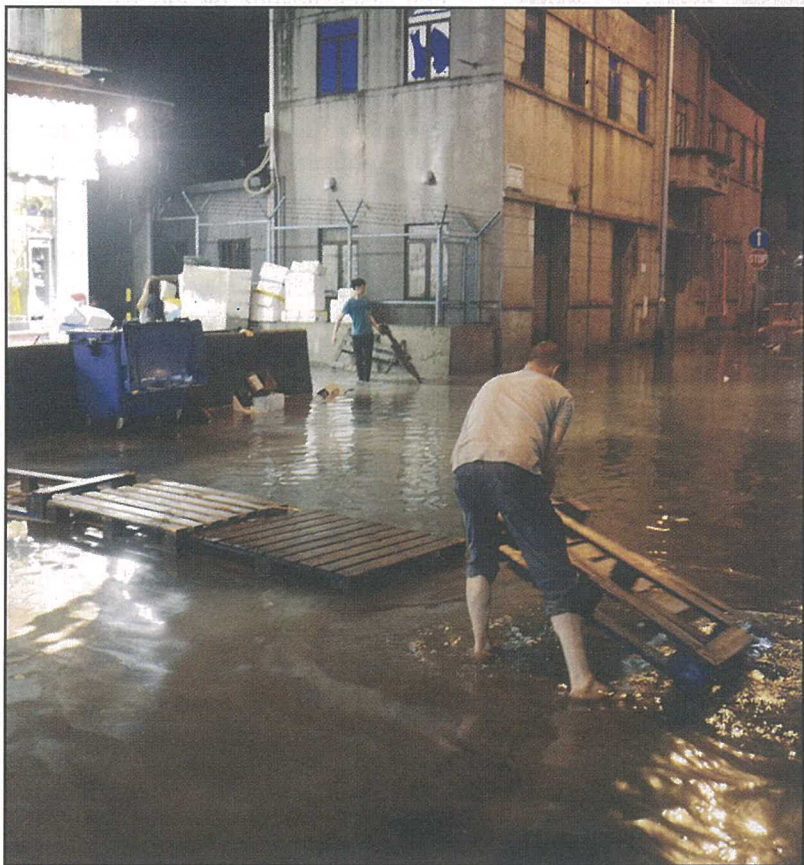
A resident lays pallets to form a temporary "foot bridge" in Avenida de Demetri Cinatti yesterday morning. The No. 3 signal for Typhoon Mujigae was still up late last night. According to the Fire Service, a woman was slightly injured when trying to open a window in a building on the former University of Macau campus during the typhoon.