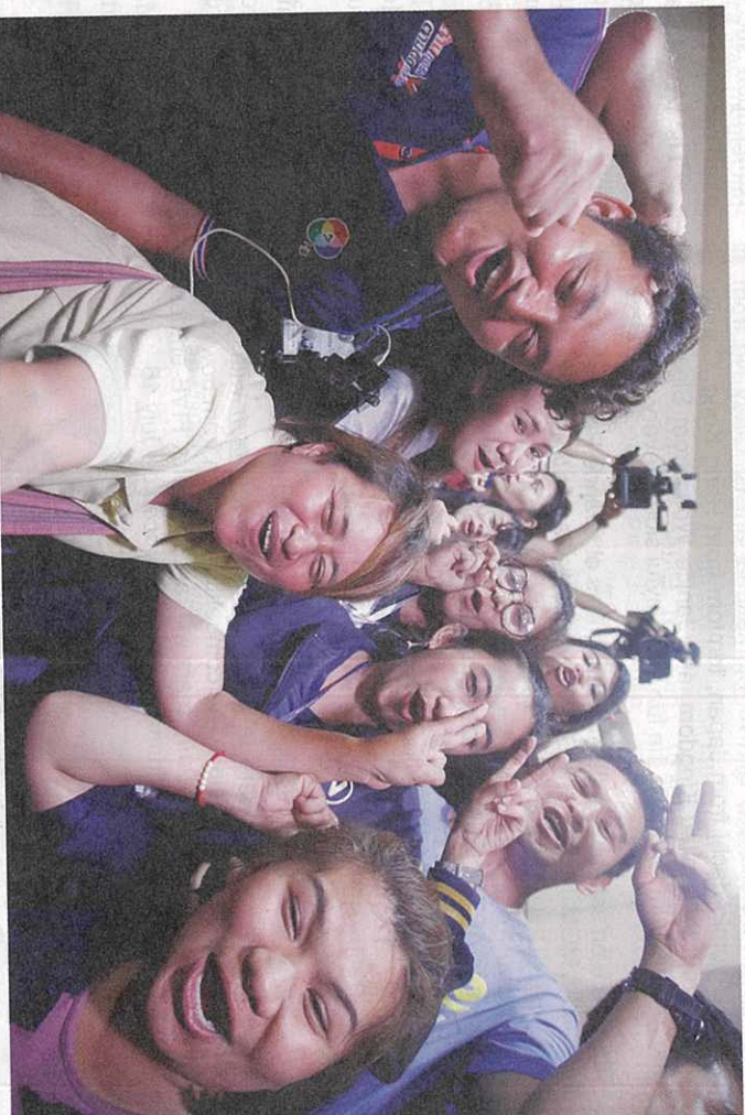
Thai media celebrate as divers evacuate the final four of the boys and their coach trapped at Tham Luang cave yesterday.